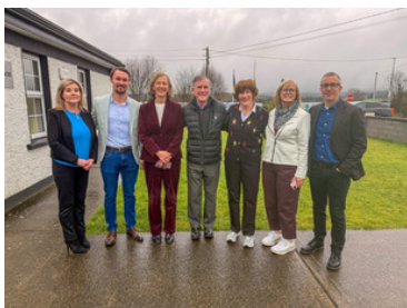
Members of the Board and SMT at the Kilcoole site following the signing of the building contract

I am pleased to report that significant progress has been made on the Kilcoole development since our last update. The access road was completed late last year enabling construction to commence on St. Catherine’s Special School – a long-awaited development for the St. Catherine’s community.